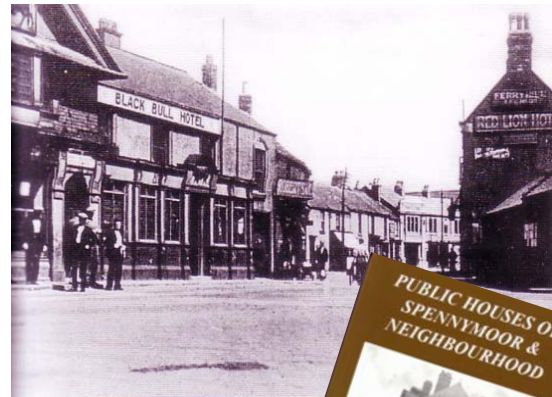
(Above) The Black Bull in Ferryhill, pictured as it was in 1934.

"I believe that the book goes some way to providing a pictorial and anecdotal history and allows the discerning