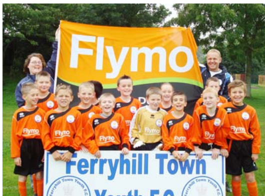
Ferryhill Town Youth Under 10's pictured in their new bright orange strip.