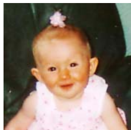
Happy 1st Birthday to a special Daughter. Love you loads, Mummy and Daddy. xxx