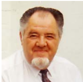
Happy 70th Birthday. Love from all the family.