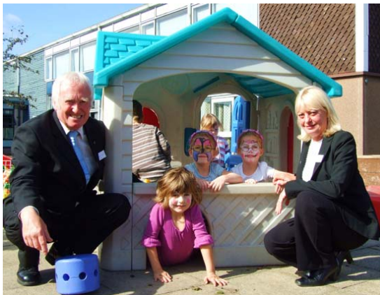
Everyone enjoyed their time at the opening of Chilton's Sure Start Children's Centre.